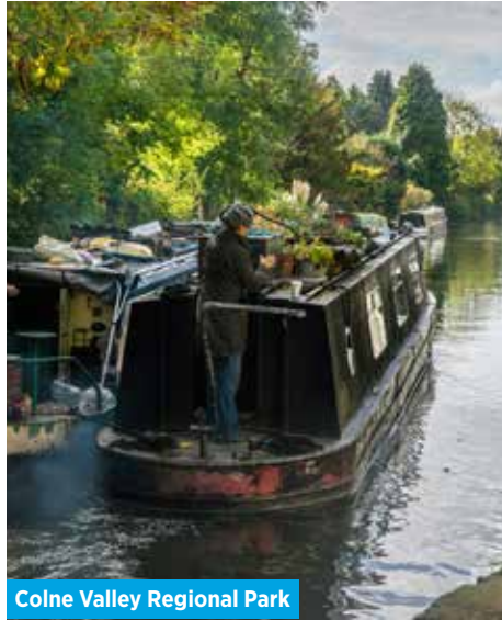
Colne Valley Regional Park

We are based in London without the stresses and expense of being in central London. By choosing to study with us you will enjoy the best of city life, whilst also being able to experience the beautiful English countryside.