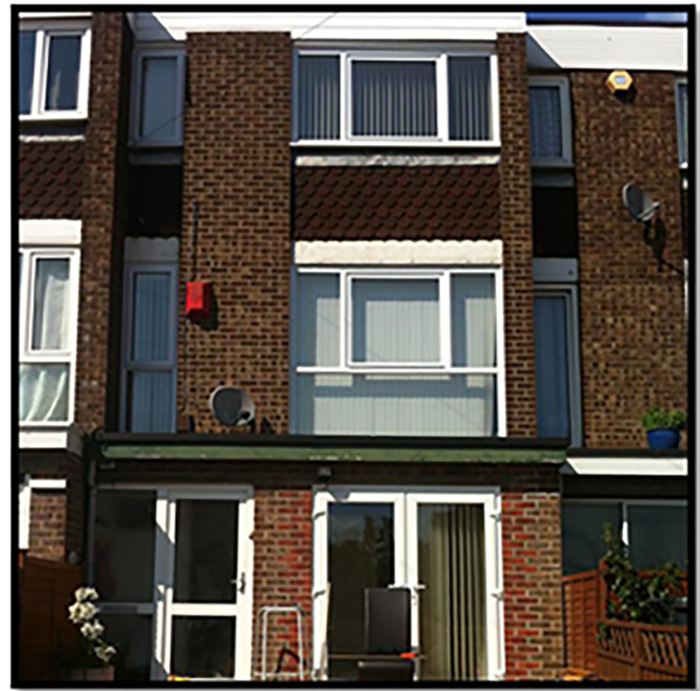
PHOTO DIARY IMAGE 2 Home.

I think my family ... really motivated me as well because none of my siblings had yet gone to university (interview).