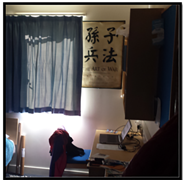
PHOTO DIARY IMAGE 6 Study bedroom.