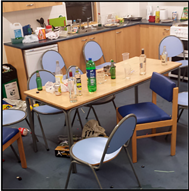
PHOTO DIARY IMAGE 3 Halls of residence.

friendship, where experiences can be exchanged. Peer support creates and is created by the materiality of these encounters: