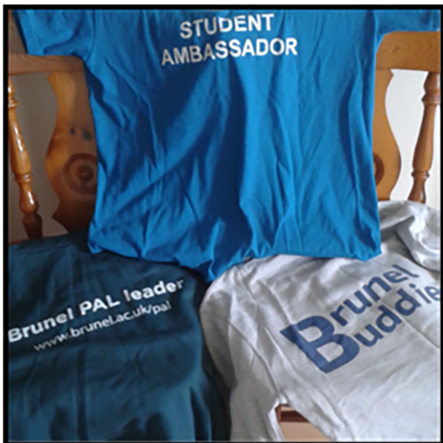
PHOTO DIARY IMAGE 1 T-shirts.