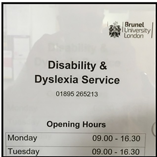
PHOTO DIARY IMAGE 5 Disability and Dyslexia Service.

This very physical materiality is coupled with resources such as Blackboard Learn that also are figured in photographs and are essential in the process of producing university work.