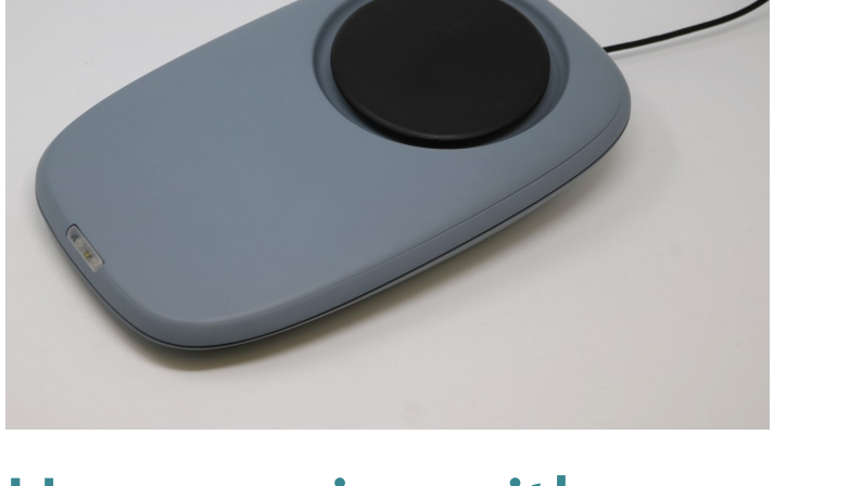
Upper casing with large movable foot controlled mouse