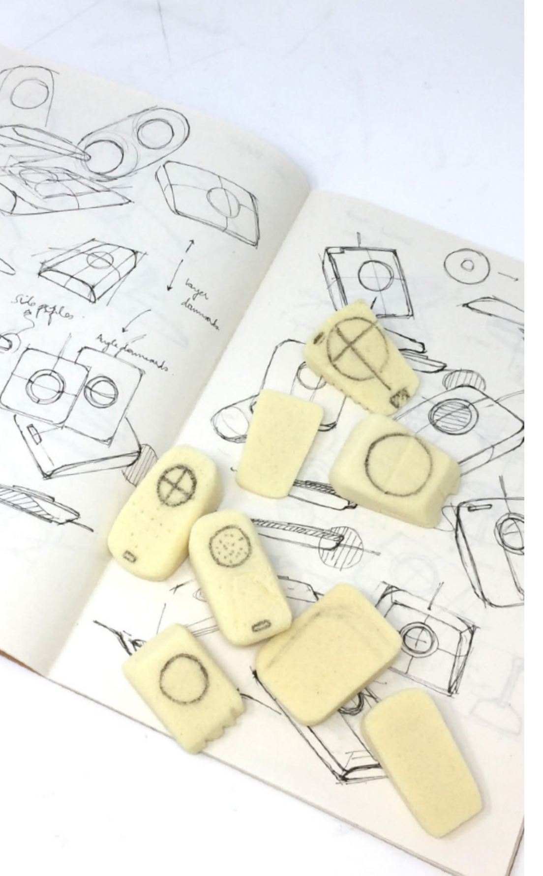
Test rig prototypes in foam and wood