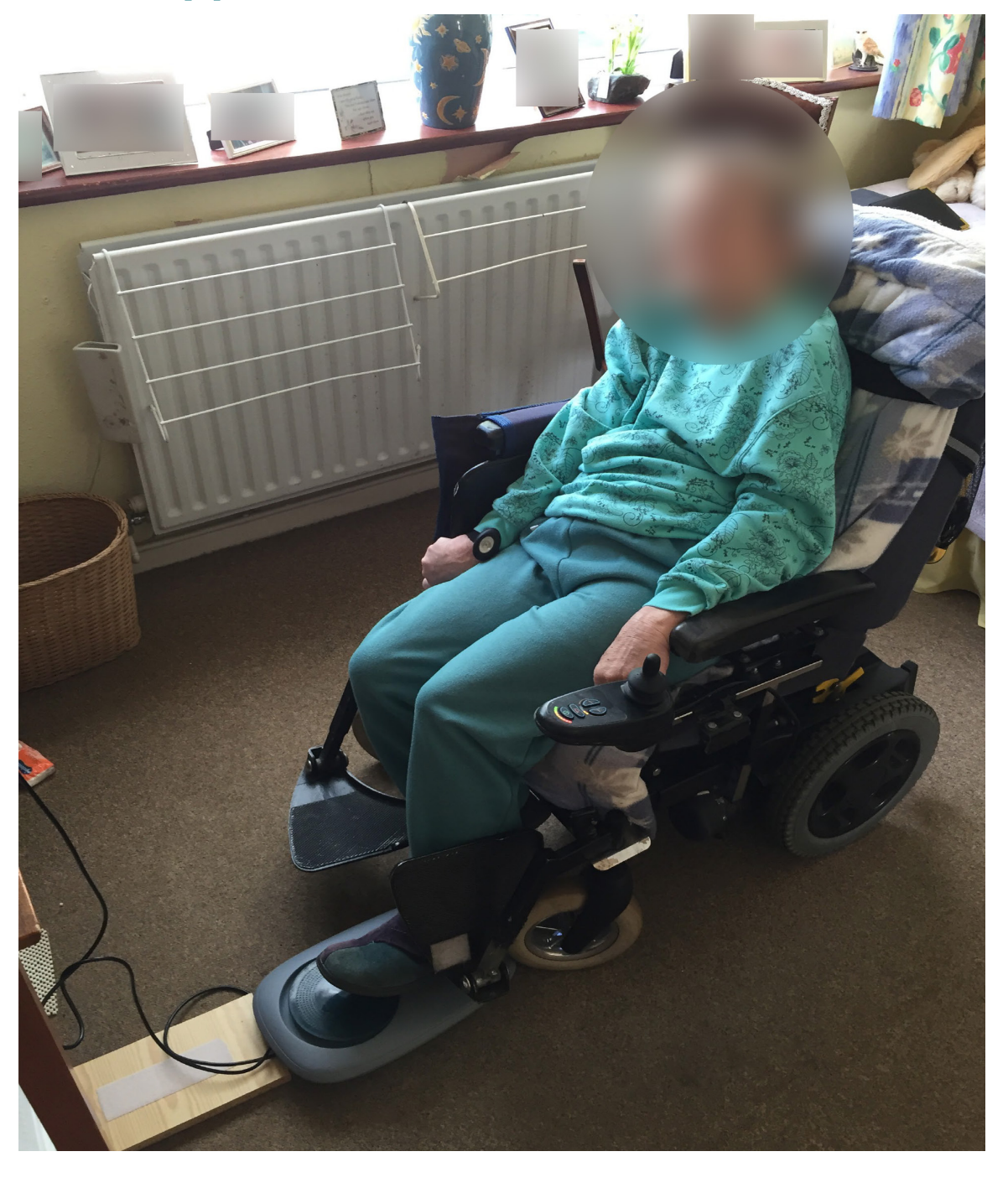
"We were able to adjust the cursor speed and click sensitivity to her requirements thereby facilitating an adaptable experience."